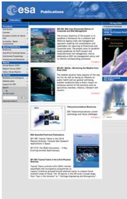
A full listing of ESA publications is available at www.esa.int/publications

Multi-Spacecraft Analysis Methods Revisited (February 2008) G. Paschmann & P.W. Daly (Eds.) SR-008 // 100 pp Price: 30 Euro