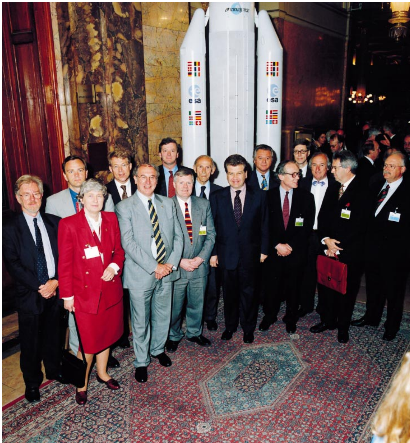
Minister Yvan Ylief, Chairman of the ESA Council at Ministerial Level, and Representatives of the ESA Member States who participated in the Brussels 25th Anniversary Celebration, gathered in the foyer of the Hotel Metropole, with a model of Ariane-5 as a backdrop