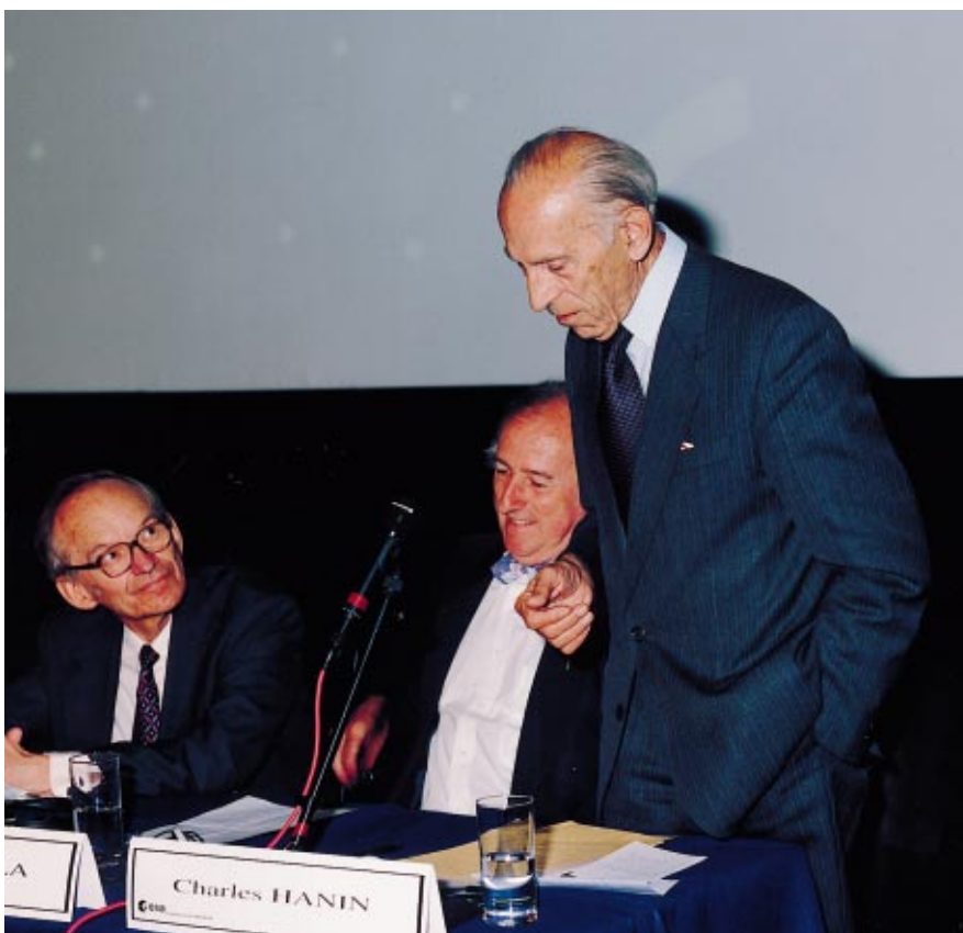
Rounding off of the Panel Session by Mr Charles Hanin, former Belgian Minister of Scientific Policy, and Chairman of the 1973 European Space Conference