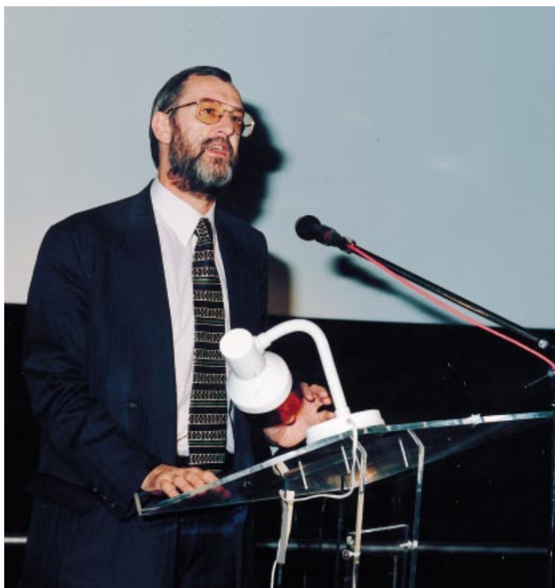
Mr John Battle, UK Minister of State for Science, Energy and Industry and Chairman of the European Union's Research Council, addressing the assembled guests and representatives of the media during the opening of the 25th Anniversary Celebration, at the UGC Cinema in Brussels