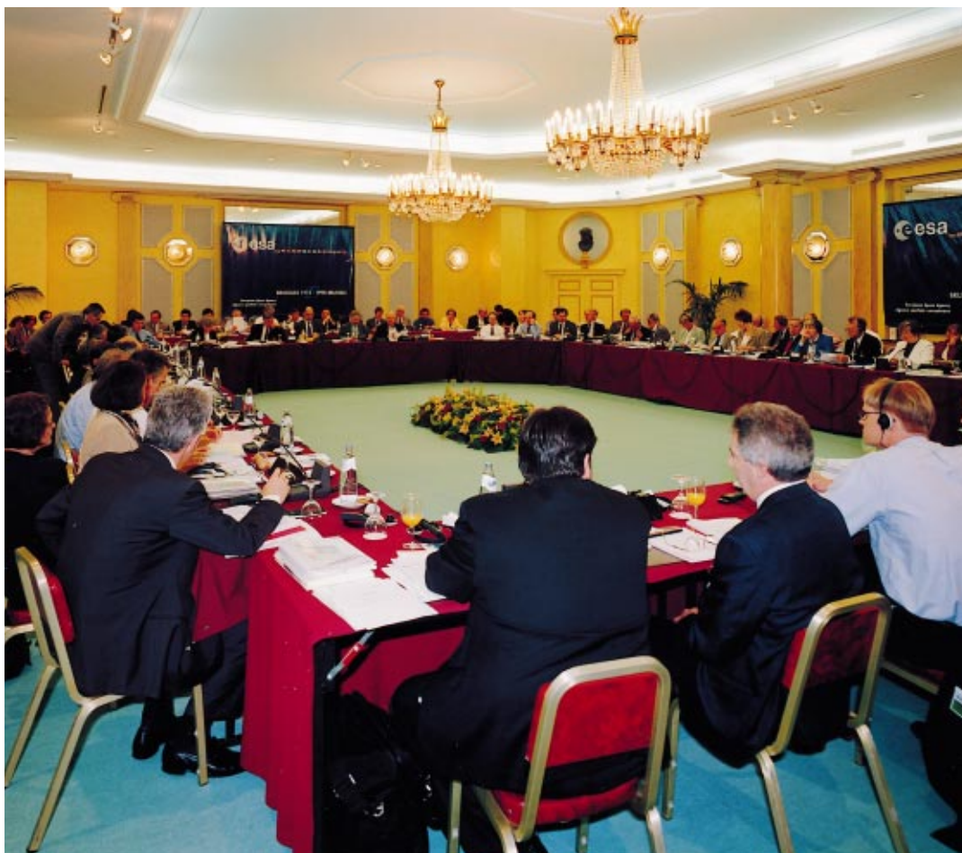
The Brussels Council Meeting in session in the Salon Excelsior of the Hotel Metropole