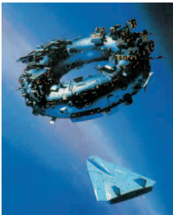
Artist's impression of a future space colony (Courtesy of Tim White)

Based on all of the above experiences and discussions, now seems an appropriate moment to begin the pioneering activity of building the first real SpaceHouse, in which to live and work and demonstrate its wider market potential. Several space-technology suppliers have indicated their willingness to provide support in terms of knowhow and hardware, and to look at the 'advanced building sector' as a potential complement to their core businesses. Europe's boat and yacht builders already have installed capacities for the