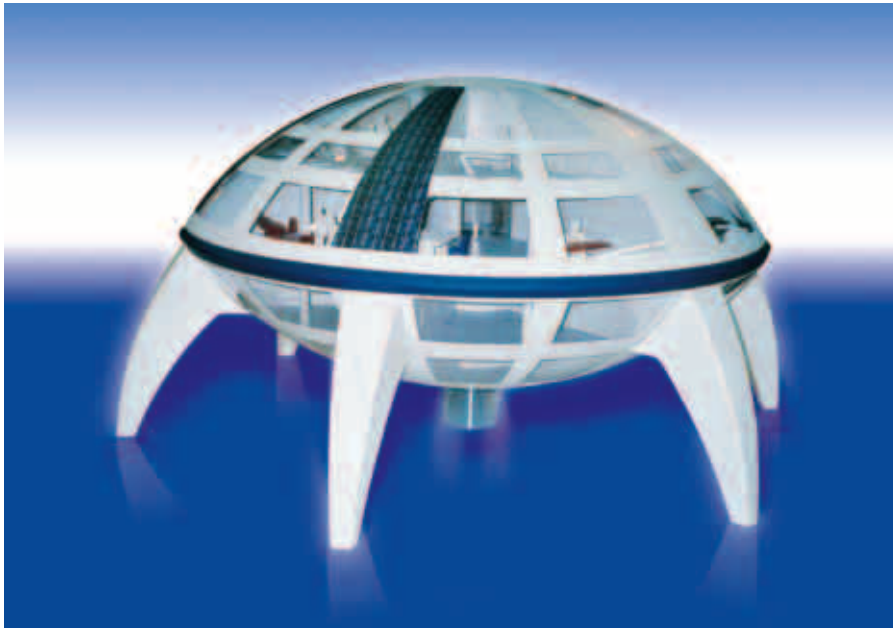
An early ESA SpaceHouse concept

way that they do not ‘seal the ground’, and thereby avoid any further lowering of ground-water tables. A combination of today’s space materials and lightweight composites would be well-suited for such applications, and would also allow striking new structural shapes. The accompanying evolution in building techniques would be comparable to the materials revolution that has overtaken the yacht and boat industry in recent years. Faster and more up-to-date city-planning methods supported by satellite remote-sensing technologies can be an indispensable aid in this respect.