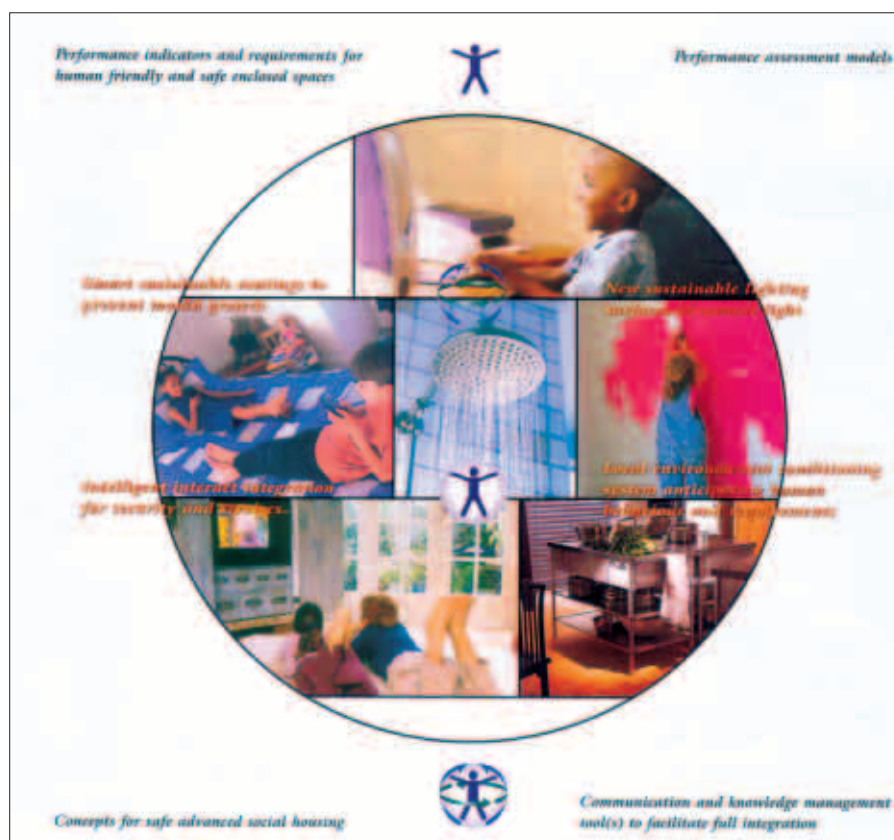
Requirements for human-friendly and safe enclosed spaces

(Departement des Landes, La Region Aquitaine) would like to establish a highly visible 'communications platform' for the region by exploiting the SpaceHouse concept. The region would like to present itself as a centre for 'high-tech' located within an environment of great natural beauty, a region in tune with the future where sustainable development can be combined with economic growth.